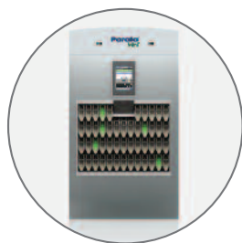
Counting and Dispensing Technologies

We offer a portfolio of retail automation solutions, designed to work individually or in concert, to dramatically increase the productivity of any pharmacy.