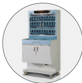
Retail Compliance Packaging