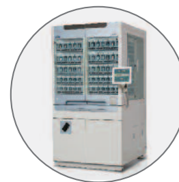
Long Term Care Compliance Packaging